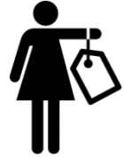
Sex Trafficking Victim Services