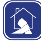
Domestic Violence Victim Services