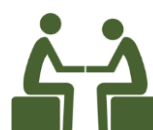
Mental Health Care/ Counseling