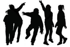
Youth Programs/ Services